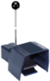
Carrying handle TST